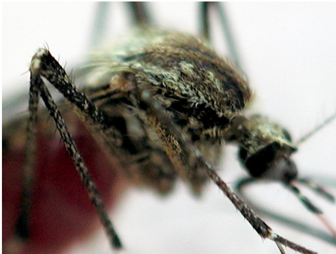
Human West Nile virus activity, California, 2003-2016